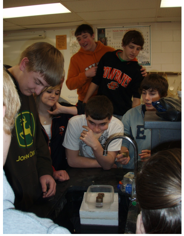
Other students look on as the boat builder adds weights during the contest.