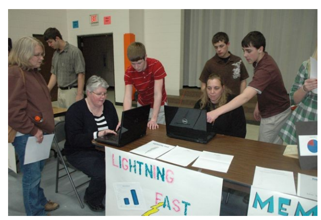
Students tested the reaction times of willing participants, and males were still found to be quicker than females.

Alone we can do so little; together we can do so much.