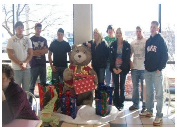
EPS seniors take a quick research break to pose with one of the mall's Christmas displays.

Twas the middle of November and all through the school, not a student was complaining; all seemed to be cool. No heads were hung low, no late assignments did they dare; just quietly waiting for Christmas break to get there.