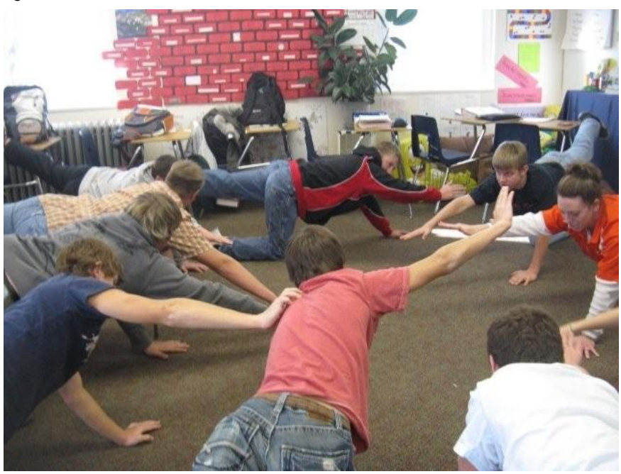
Mrs. Shoe and students are exercising both side of their brain in the brain gym!

As usual, upon return to her classes Monday morning, Mrs. Shoe began implementing some of the activities. These consisted of optical