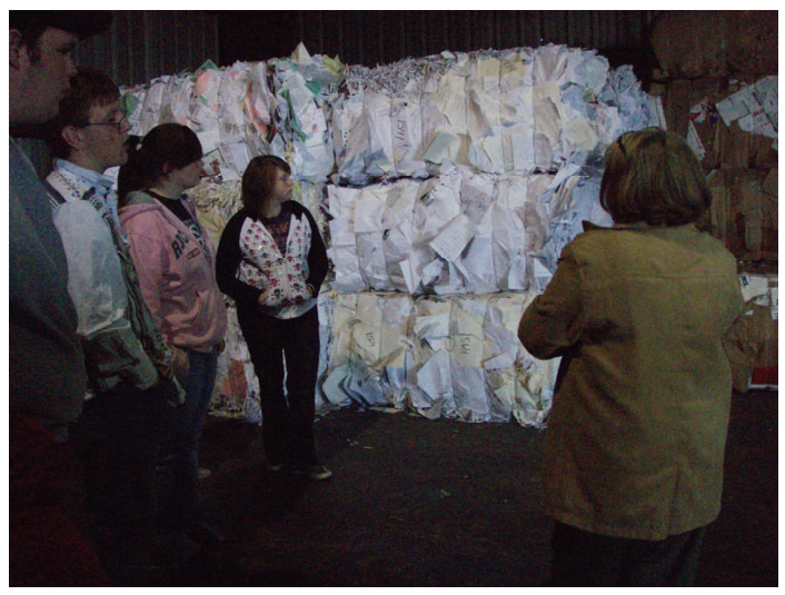
Students tour bales of garbage at Vermillion solid waste dept.

The Environmental Science students spent Earth Day learning firsthand how our waste management and energy choices affect the earth. Students had the privilege of taking part in a comprehensive field trip to various sites in the area.