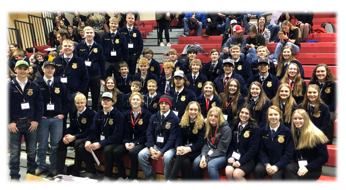
The FFA members participated in the District FFA CDE Contests.