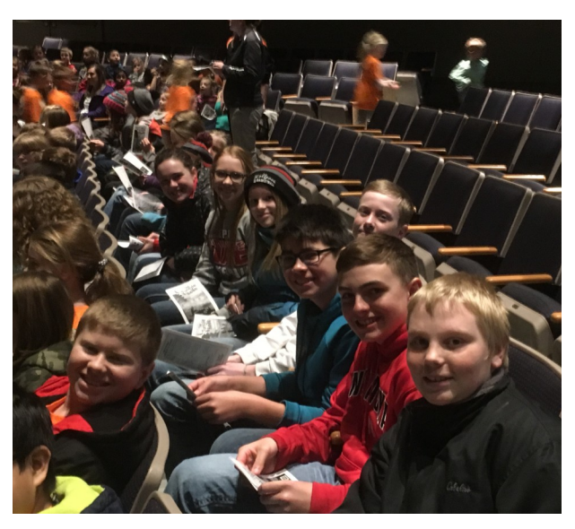
All elementary students enjoyed their time spent at Wayne State College. Here they had the opportunity to watch The Jungle Book .