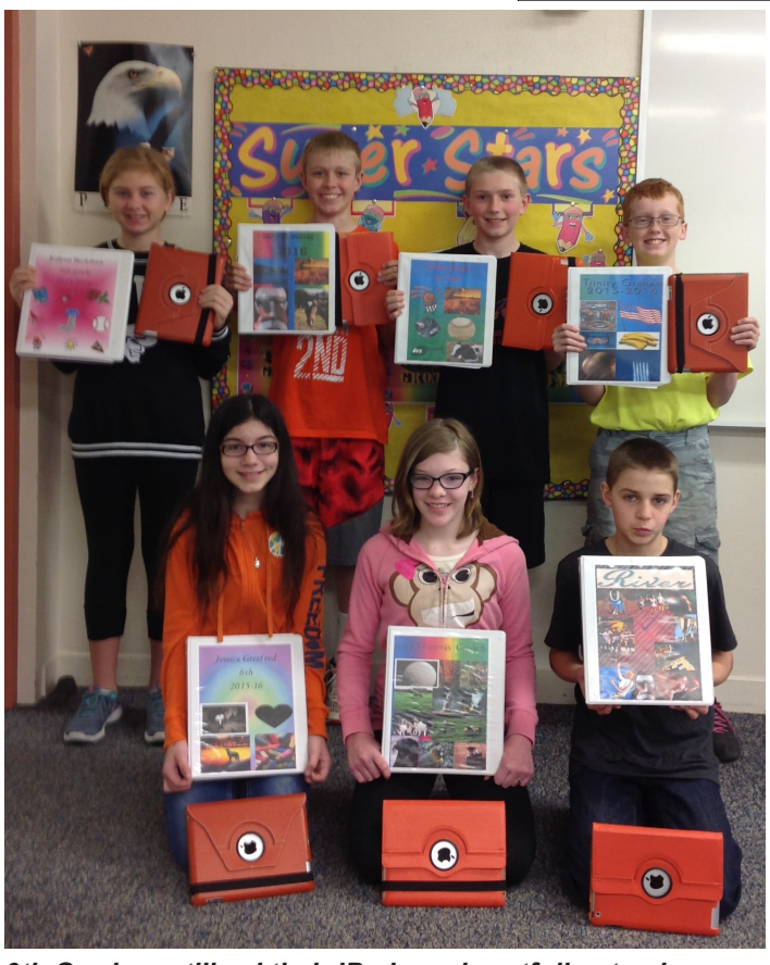
6th Graders utilized their iPads and portfolios to showcase their year for their parents. Students: job well done. Parents: thank you so much for coming.

The fourth graders are publishing their own book after all the writing they've done this year. They decided to write about what they've learned this year, what their classes were like, and some of their favorite memories. Both illustrations and digital pictures are in the book. They are learning a lot in the process and will have a cool keepsake for years to come.