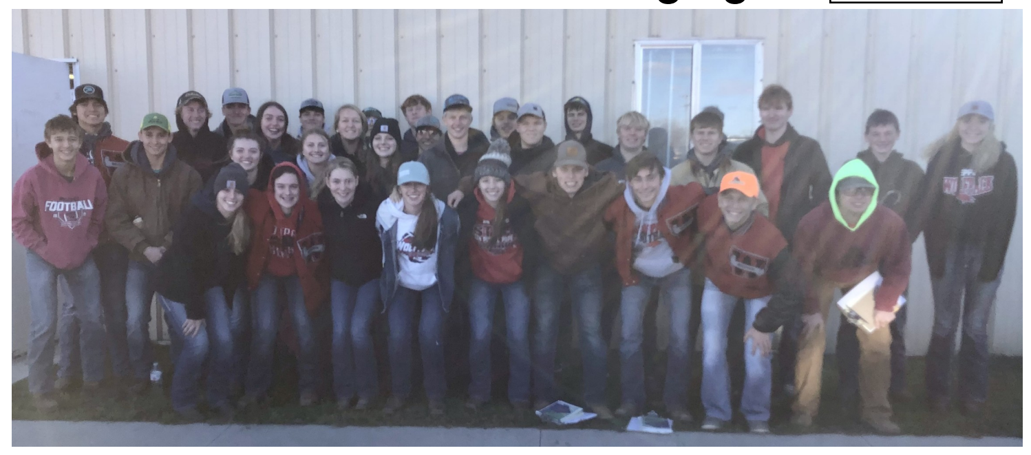
Elgin FFA Members look ready to compete in the District FFA Livestock Judging contest in Ord on November 17, 2021.