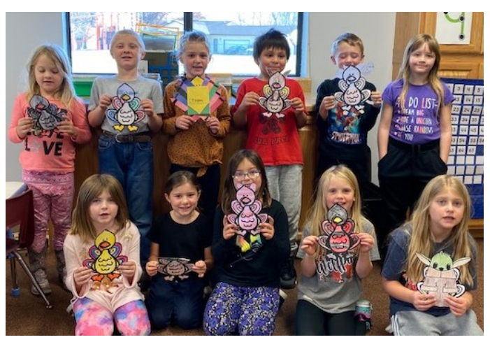
The 1st graders aren't letting their turkeys get caught this year! They came up with such great disguises!