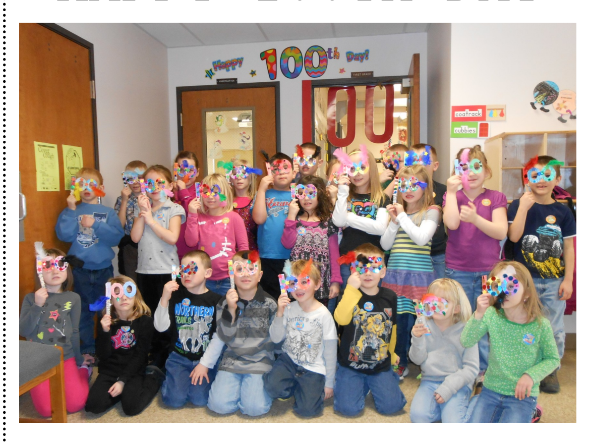
The Kindergarten and First Grade celebrated the 100th day of school on January 21, 2013. We spent the day doing many activities with the number 100.