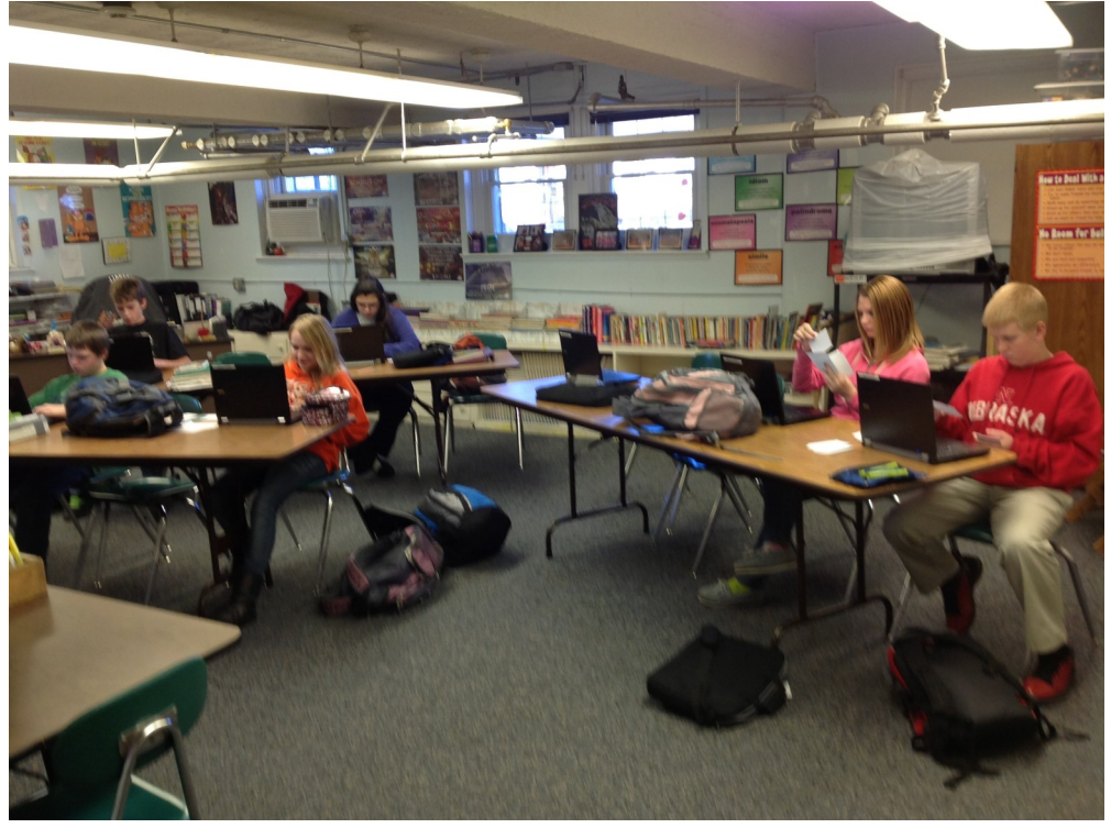
7th graders are preparing their topics for the science fair March 21st.

materials that could be used from the Encyclopedias, Almanacs or using the Periodical Guide. Students also learned to use FBSCO Host, a database of reliable articles from sources all across the United States. Students needed to learn that not everything that is on the Internet is reliable and sometimes it can save a lot of time using a different source.