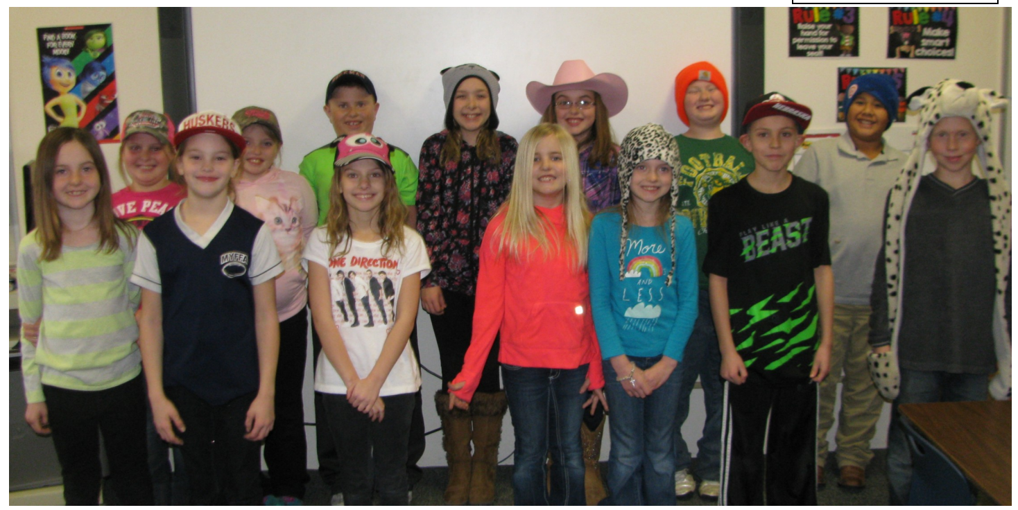
"Cool Cats in Hats!" The 3rd graders celebrated their class points reward by wearing a hat in class!