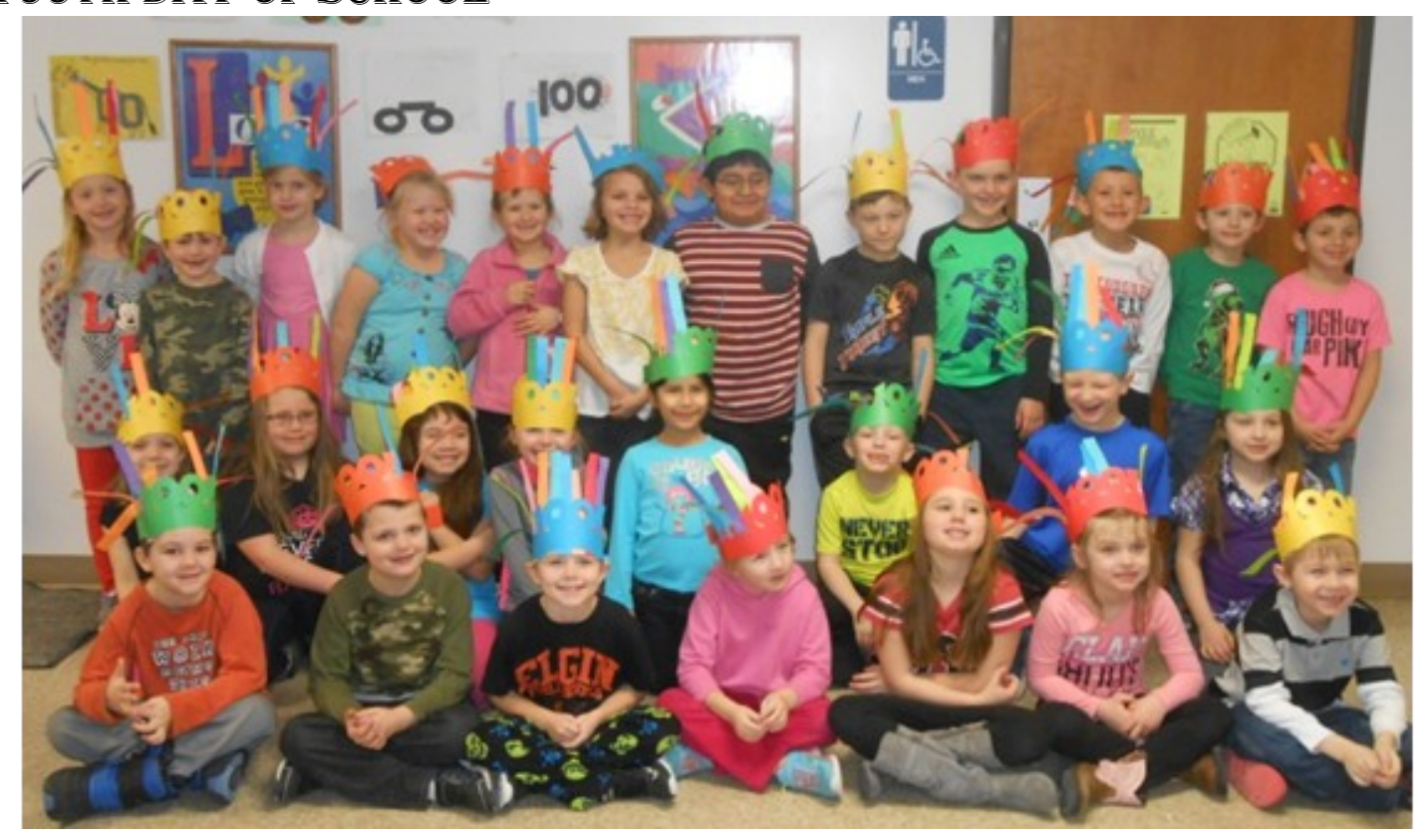
On January 22, 2016 the Kindergarten and First Grade celebrated the 100<sup>th</sup> day of school. They did many activities using the number 100. These are the hats they made for the day.