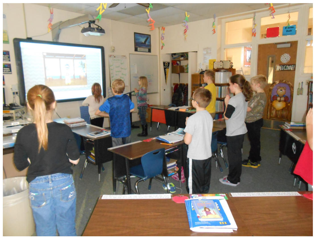
Third Grade students are shown taking a brain break to awaken their brain cells before the next task!