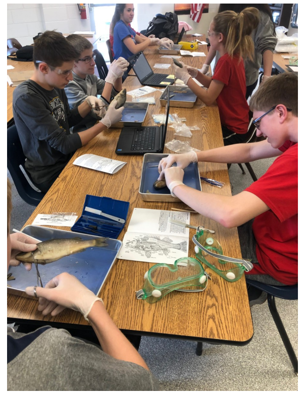
The freshmen and 8th grade agricultural classes were able to dissect perch in class.