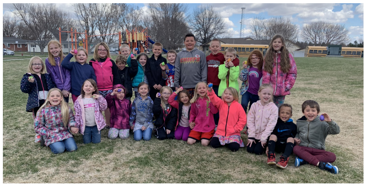
The second grade hid an Easter egg on the playground for the kindergarten class.

Find a summer job to help pay for college expenses . Ask prospective employers if they offer education assistance programs.