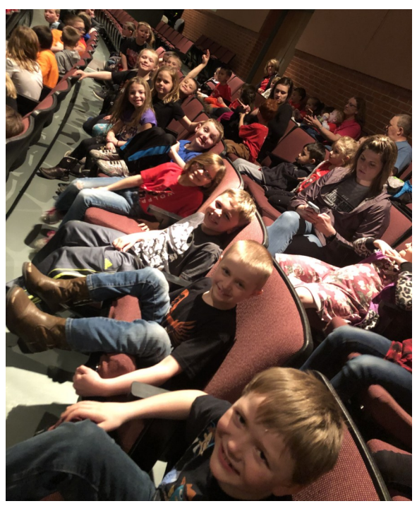
First graders had so much fun at Pete the Cat in Norfolk on March 27th!