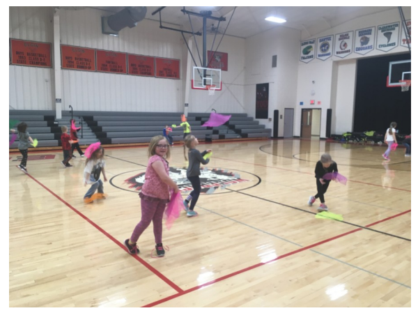
1st and 2nd grade have been working on their juggling skills in P.E.