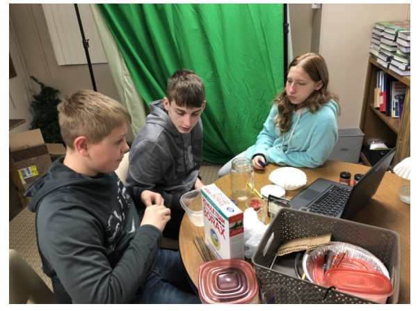
Science Fair Preparations are Underway

The junior high science classes have been busy preparing for the annual science fair. They have been using scientific inquiry to answer science related questions and problems. They have learned that there are many steps required to prepare for this event, and it is far more extensive than simply conducting an experiment. They have identified a problem, conducted careful research, formed a question, and made a hypothesis. After they have completed those steps, they experiment, collect data, analyze the data, and draw conclusions to answer that original question.