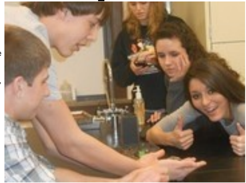
Many students overcame their fear of tarantulas when they actually held one in their hand.

While there, the students were also treated to a visit to the insect zoo. Here a Briar Cliff biology student explained the different creatures they kept and information about each one. Students were invited to hold or touch these creatures. Many students took advantage of