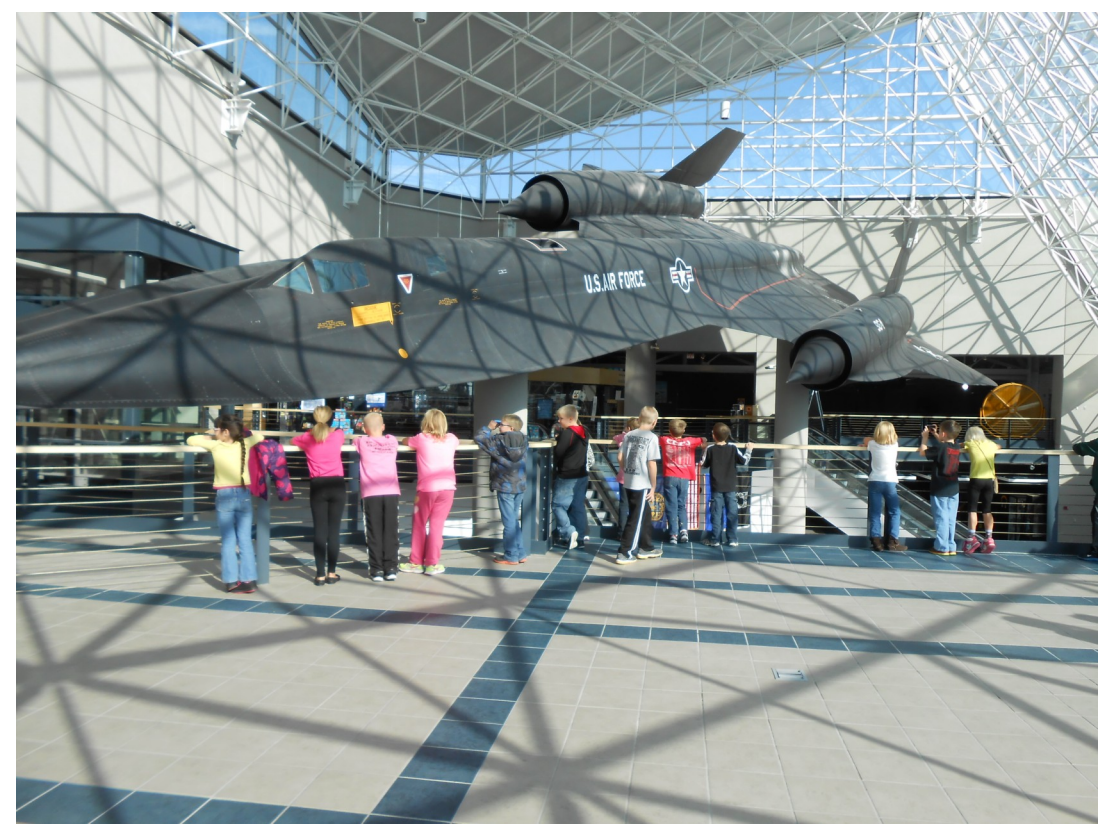
Students view aircraft at the Strategic Air and Space Museum in Ashland, NE

The third and fourth grade classes recently visited the Strategic Air and Space Museum in Ashland with Mrs. Borer and Mrs. Eisenhauer. The students and teachers were greeted by a huge Air Force jet as they entered the museum. The students later found out that the museum was built around the jet. The students participated in a Math Alive! workshop where they learned about probability. Students were able to make their own spinner and test the probability of it landing on different colors. After the workshop, the students were allowed to explore the different stations in the Math Alive gallery. Some of the favorite stations were the rock climbing wall, snowboarding interactive and the 360 degree camera/video shoot. Each station taught a lesson related to mathematics.