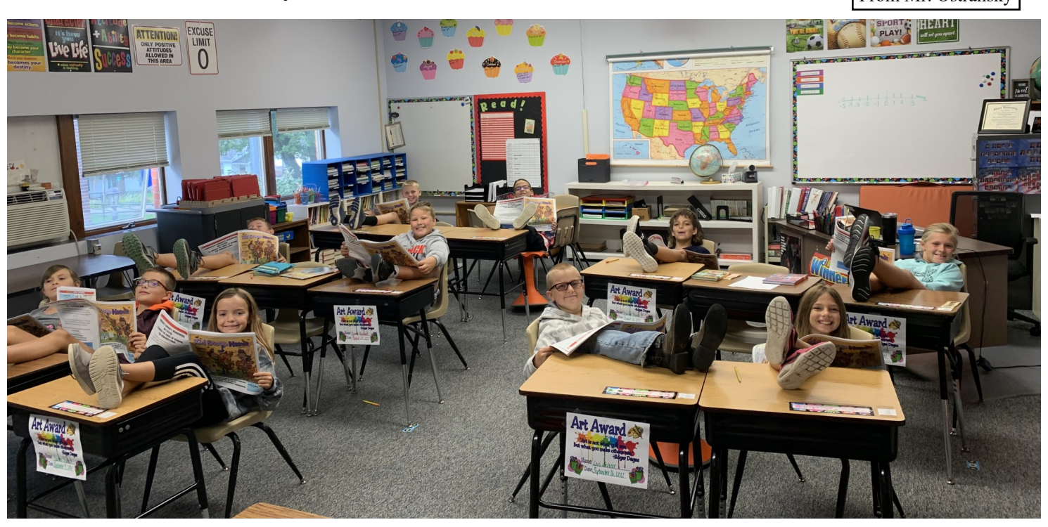
The 4th graders were able to kick back and read the morning newspaper Friday. Thanks to the Elgin Review for providing us with Kids Scoop News!