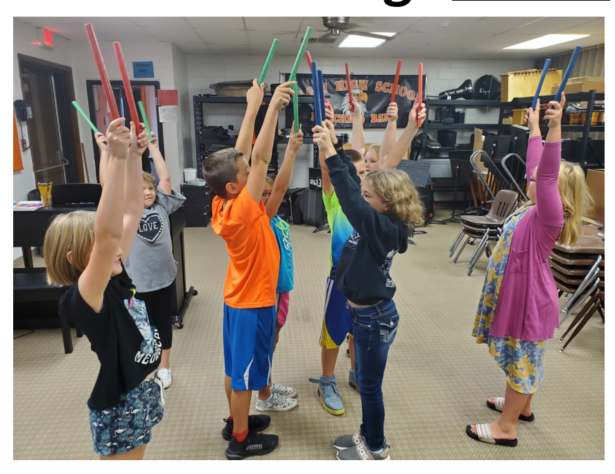
Here are the 3rd graders performing a stick dance along with the song Diwali, Diwali from India.