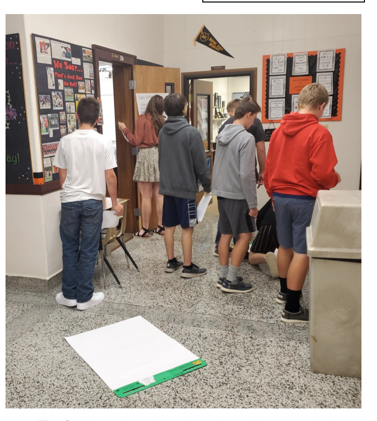
The freshmen have been busy brushing up on their grammar skills in English 9 this quarter. Soon, they'll be putting their newfound knowledge to use as they create different pieces of writing this year.