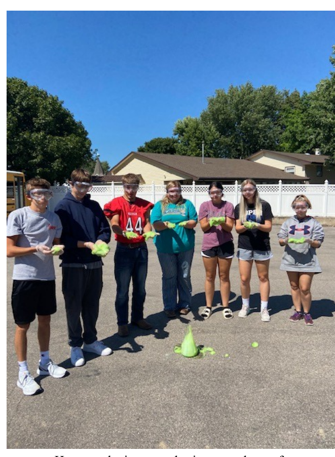
Here are the integrated science students after making some elephant toothpaste.