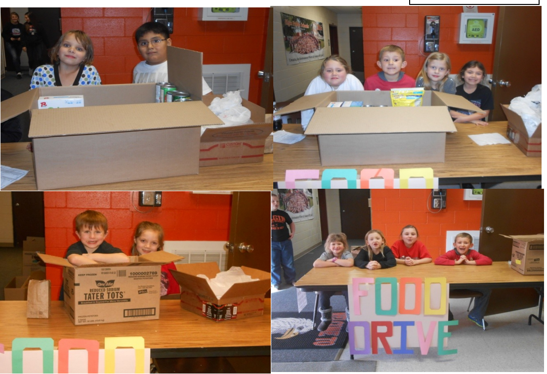
On January 28, the First Grade held a Food Drive during the EPPJ basketball games. Thank you to everyone who donated food. All food was given to the local food pantry.