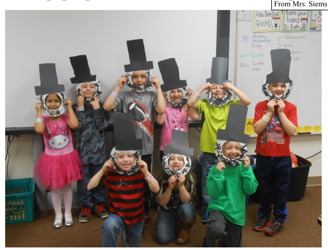
The kindergarten students celebrated Abraham Lincoln's birthday by creating Lincoln masks.

Plan to Attend: Student-Led Conferences March 17th Classes dismiss at 1:00 p.m. Conferences begin at 4:00 p.m. Watch your mail for your assigned appointment time!