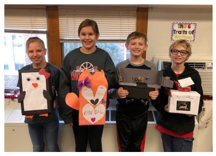
The fifth graders decorated boxes at home for Valentine's Day!

The eighth graders have been exploring weather and atmospheric conditions this quarter during science.