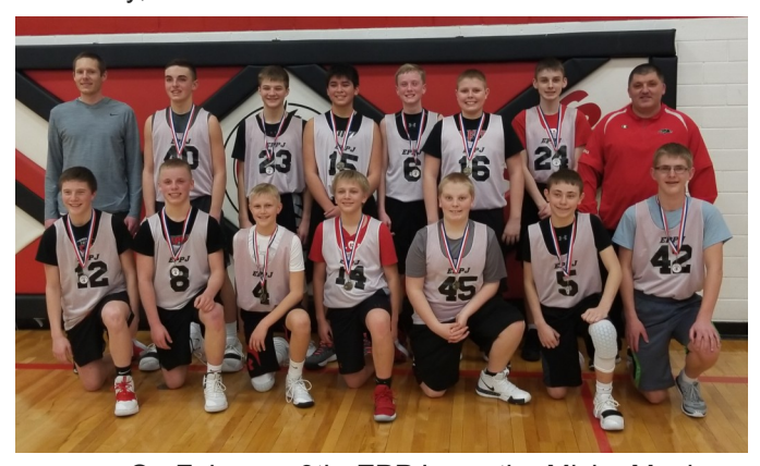
On February 9th, EPPJ won the Misko Mania tournament in Ord. All three games were come from behind wins! Great job for keeping your heads in the game!