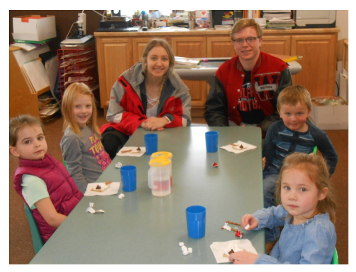
In celebrating FFA Week members of the FFA visited the Preschool classroom and made snacks with them. Thank you for all you do for us!