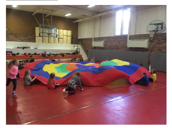
1st and 2nd grade did some parachute work in PE by playing a game called Sharks and Lifeguards!